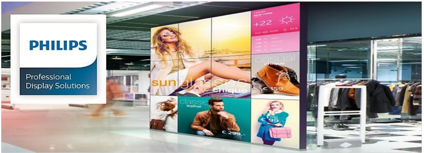
EXTERNAL MARKETING NEWSLETTER